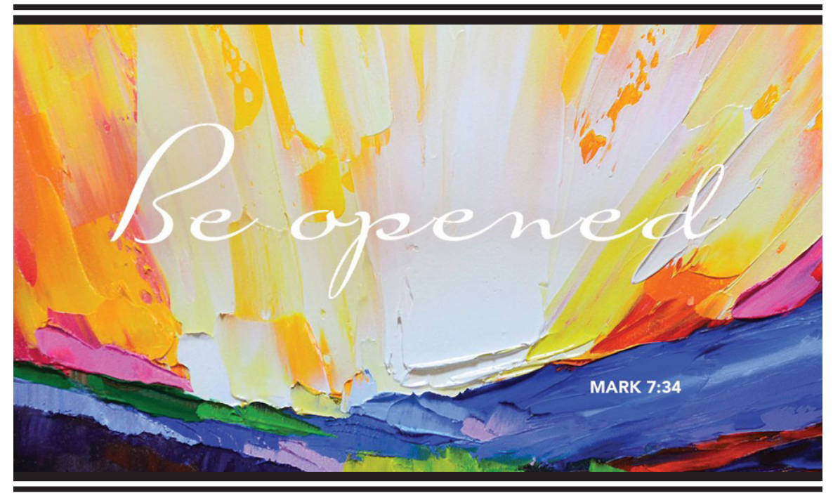
Image: Praise to the Lord by Mike Moyers. Copyright © Mike Moyers. All rights reserved. Used by permission of the artist.