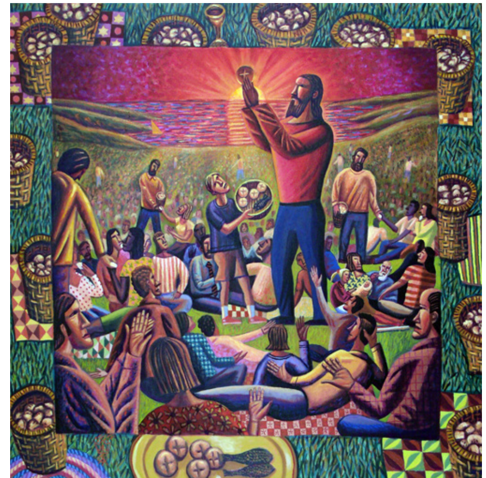
Feeding the Five Thousand

Copyright © James Janknegt. All rights reserved.